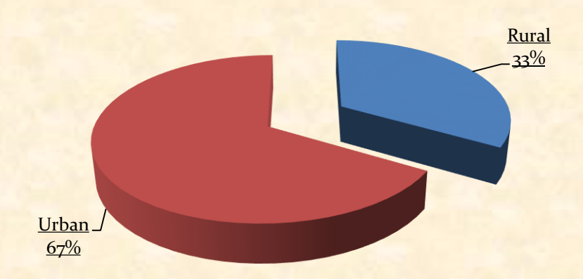
Area-wise Student Enrolment (2961) Session 2016-17

The diagrams presented above clearly demonstrate that the objectives of the distance education programme of DEI are being met to a substantial degree in that the benefits of DEI's quality education and training via the distance mode are reaching the economically weak persons in remote areas, especially women who did not have access, hitherto to quality education at affordable low cost or even free of cost.